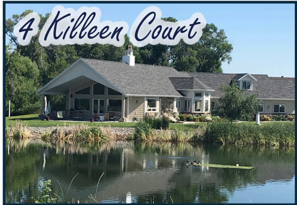
4 Killeen Court