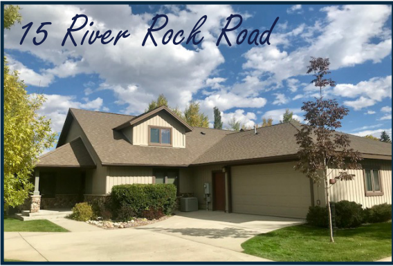
15 River Rock Road