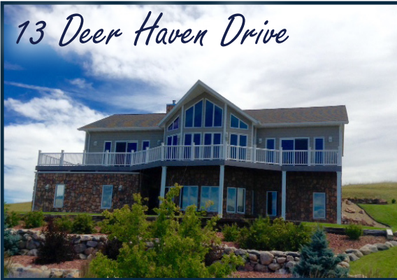
13 Deer Haven Drive