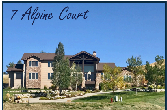
7 Alpine Court