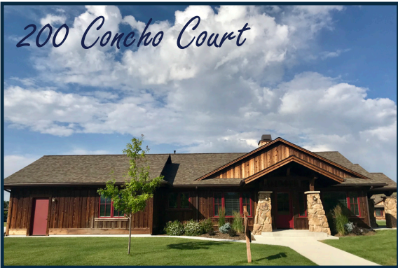
200 Concho Court