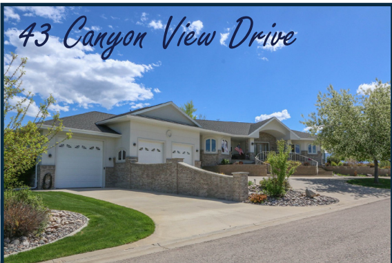
43 Canyon View Drive