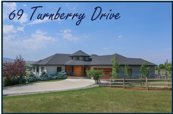
69 Turnberry Drive