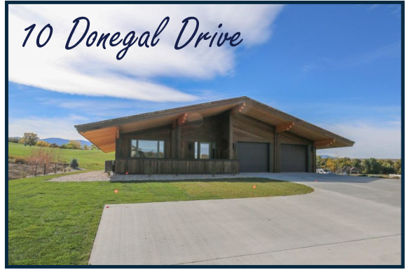
10 Donegal Drive