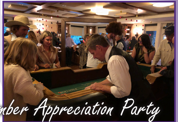
Member Appreciation Party